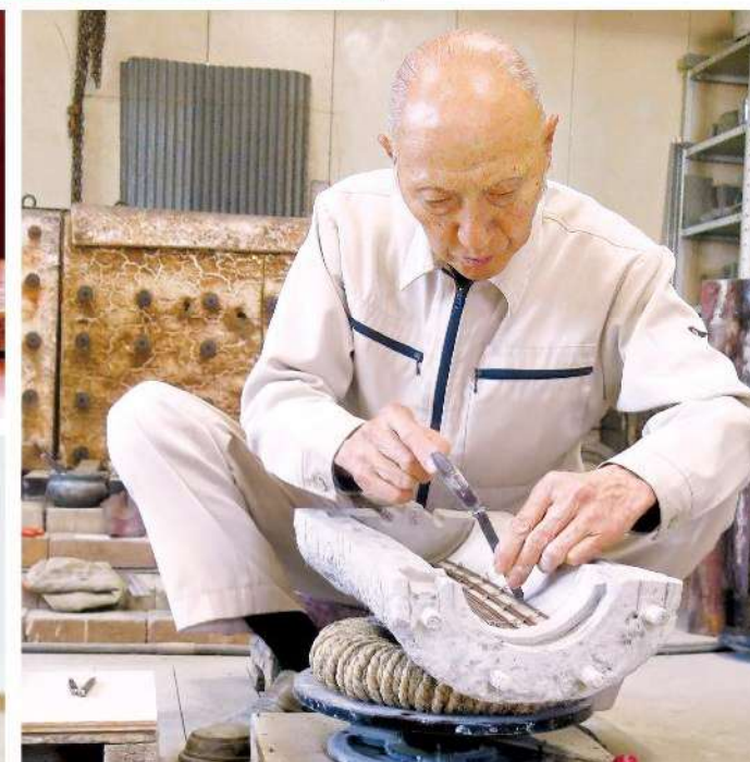
Living National Treasure: Ozawa Komin (Preserver of the Important Intangible Cultural Property Chūkin , in the category of metalworking).